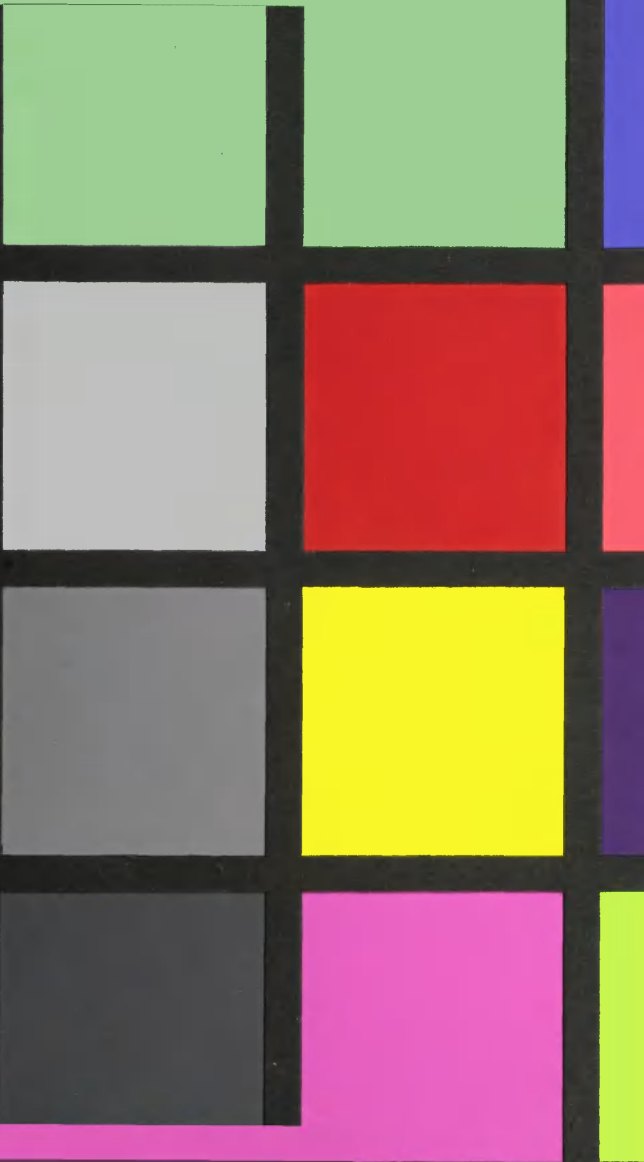
GretagMacbeth™ ColorChecker Color Rendition Chart